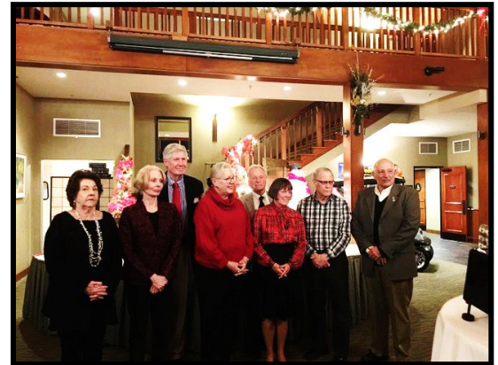
Our new Officers and Directors