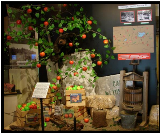
Mountain Apple Orchards (1860's - today)