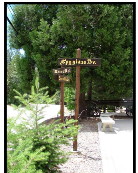
Street Signs From the 1960's