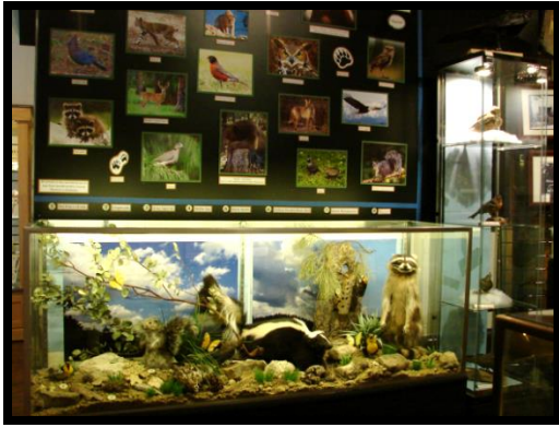
Revamped native animals Exhibit

Here are a few pictures of the new or renovated in our museum this year. Come check them out for we know you will see new things you haven't seen before. We look forward to seeing you.