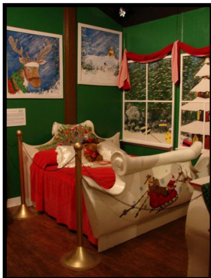
Updated Santa's Village Exhibit