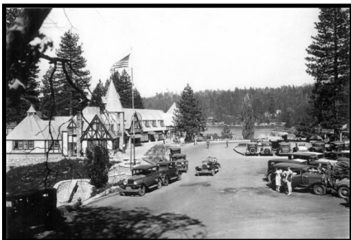
Lake Arrowhead Village, circa 1933