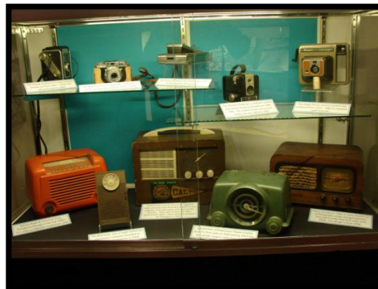
Vintage Cameras & Radios